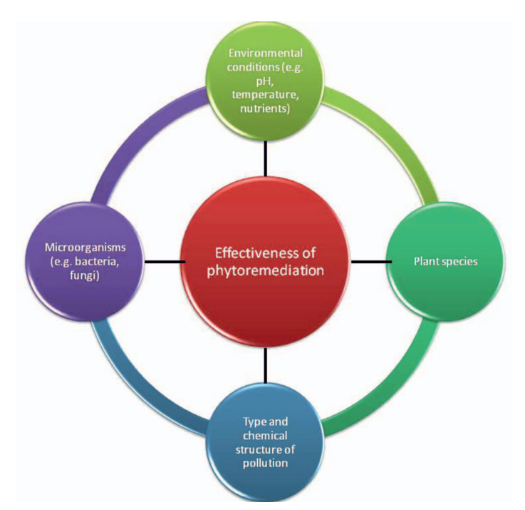
Fig. 2. A diagram showing the interdependence and influence of various factors on phytoremediation's effectiveness Rys. 2. Schematyczne przedstawienie współzależności i wpływu różnych czynników na efektywność fitoremediacji

within the soil structure. Among plants, many grass and legume species are often chosen for these purposes (Baker and Brooks, 1989). Moreover, some of these organisms are hyperaccumulators. The potential of some grass and tree species has been recognized and appreciated. Due to their relatively large biomass, they are able to uptake and neutralize petroleum compounds and heavy metals in their cells in amounts comparable to those accumulated by hyperaccumulators (Burken et al., 2011). The soil type and its granulometric composition, water content, and water-air balance, as well as microbial diversity, are also important elements which may significantly support and strengthen the transformation processes. The decomposition time of a given product depends on its chemical composition and the bioavailability of its components. In the case of petroleum contamination, various compounds (hydrocarbons and heavy metals) are absorbed and/or transformed at different rates. The degree of degradation and concentration of the substances are equally important. In addition, the presence of a diverse and rich microbiome will contribute to the pollutant's transformation into more readily available products for plants and other organisms.