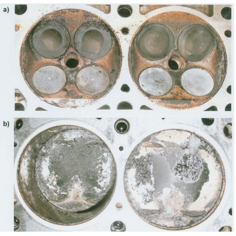
Fig. 4. Examples of deposit flaking in combustion chamber (a) and on the piston top (b)

Deposits which have been formed, are also being removed through various mechanisms divided into three groups: chemical (including oxidation and gasification), physical (including desorption and evaporation of volatile and gaseous components) and mechanical like abrasion, flaking and wash-off [12, 13] – Fig. 4.