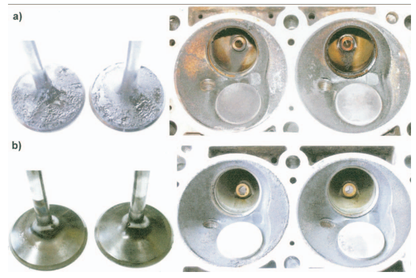
Fig. 3. Comparison of IVD and CCD for base fuel (a) and additized fuel (b)

One of the most important parameter that controls deposit formation is the surface temperature which itself changes as deposits grow because of their insulating properties.